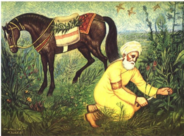
Artist depiction of Ibn al-Baitar collecting herbs for Herbal remedies

Al Dinawari described more than 637 plant drugs in the 9th century, and Ibn al-Baitar described more than 1,400 different plants, foods and drugs, over 300 of which were his own original discoveries, in the 13th century. The experimental scientific method was introduced into the field of "Materia Medica" (Rome's name given to substances of medicinal properties) in the 13th century by the Andalusian-Arab botanist Abu al-Abbas al-Nabati, the teacher of Ibn al-Baitar. Al Nabati introduced empirical techniques in the testing, description and identification of numerous medicines. He separated unverified reports from those supported by actual tests and observations. This allowed the study of basic medicine to evolve into the science of Pharmacology.