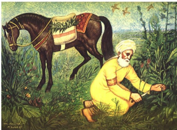
Artist depiction of Ibn al-Baitar collecting herbs for Herbal remedies

Al Dinawari described more than 637 plant drugs in the 9th century, and Ibn al-Baitar described more than 1,400 different plants, foods and drugs, over 300 of which were his own original discoveries, in the 13th century. The experimental scientific method was introduced into the field of "Materia Medica" (Rome's name given to substances of medicinal properties) in the 13th century by the Andalusian-Arab botanist Abu al-Abbas al-Nabati, the teacher of Ibn al-Baitar. Al Nabati introduced empirical techniques in the testing, description and identification of numerous medicines. He separated unverified reports from those supported by actual tests and observations. This allowed the study of basic medicine to evolve into the science of Pharmacology.